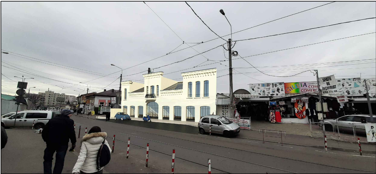
Montaj foto 3