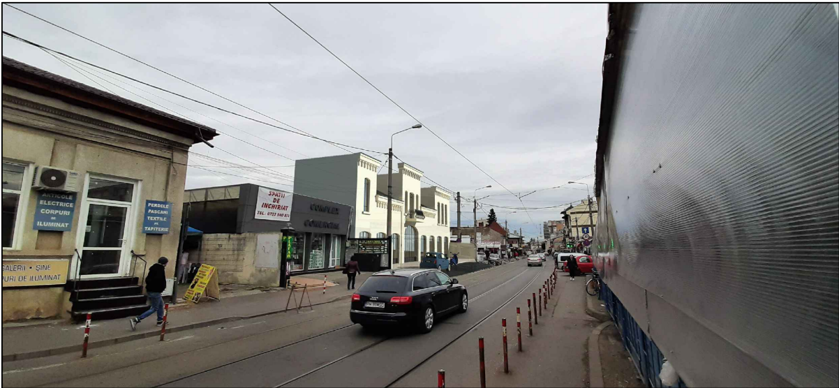
Montaj foto 3